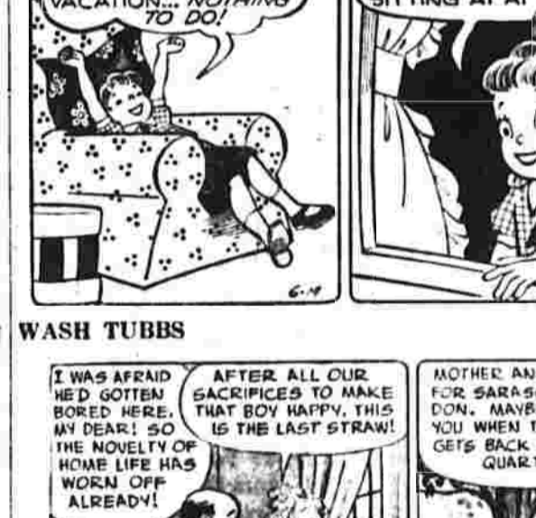
"WHAT'S THAT I LIKE AND WHY DO YOU SEEM TO BE DOING NOTHING?"