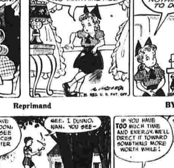
"Too Much Of A Good Thing"