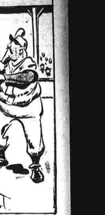
"I said I envied you your eyesight—no chance of being drafted!"