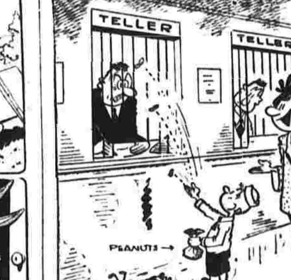
"How About A Loan?"