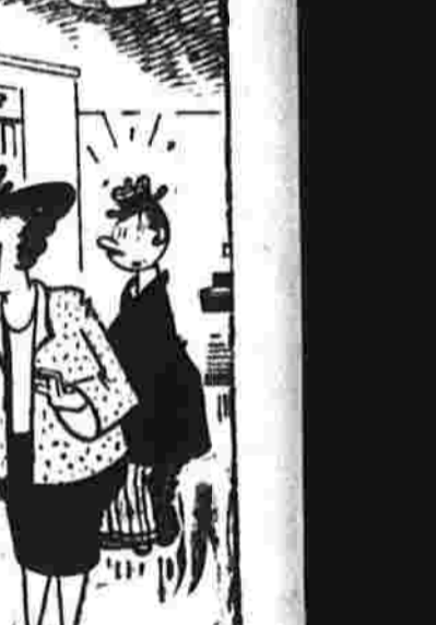
"I DON'T KNOW HOW TO PLAY THE AZTEC. I'VE BEEN TRYING TO LEARN SOMETHING ELSE SOMEWHERE."