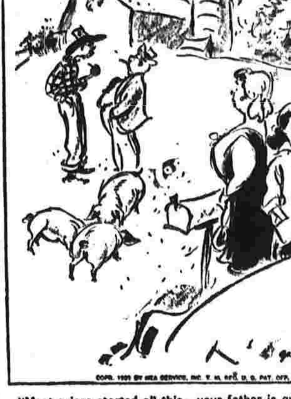
"Meet prices started all this—your father is quizzing all the farmers on what they got for their cows and pigs!"